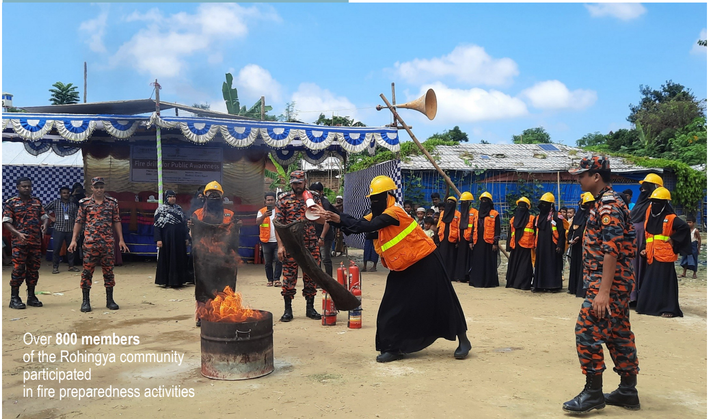
Over 800 members of the Rohingya community participated in fire preparedness activities